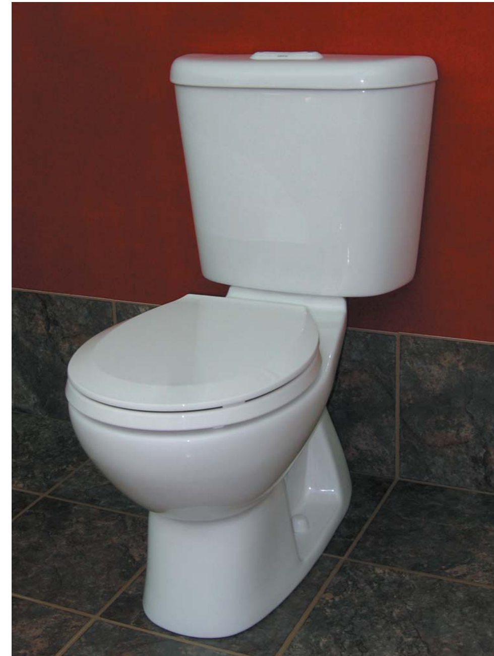
Sydney Smart 305 Round Front Plus